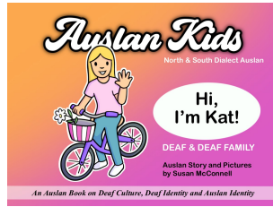
Hi, I'm Kat! DEAF DEAF FAMILY